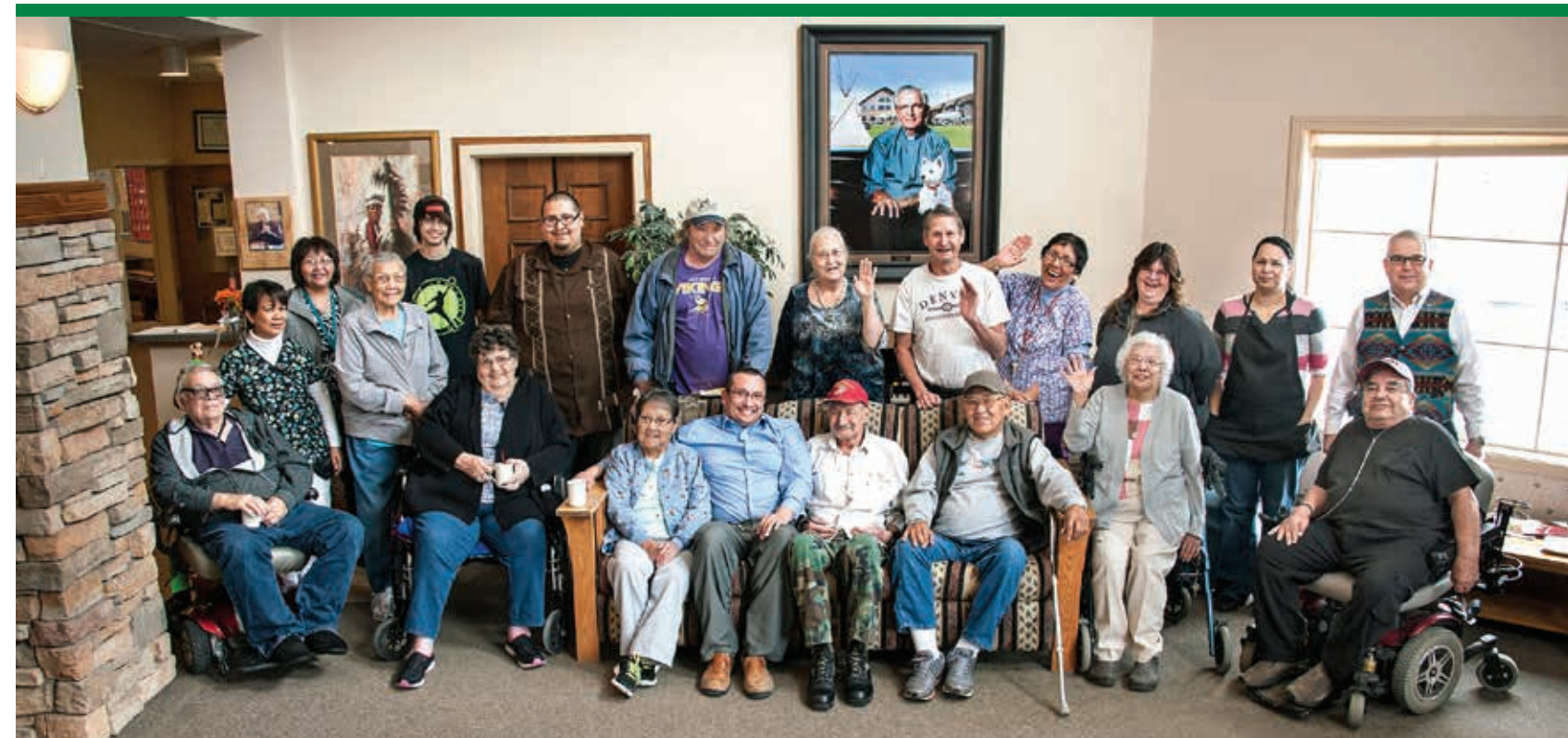
Some of the elders and staff gathered for a "family" photo to say thank you to our donors.