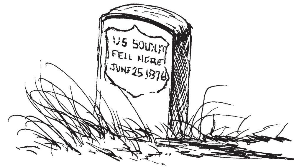
Sketch of a soldier's headstone at Little Bighorn Battlefield National Monument.