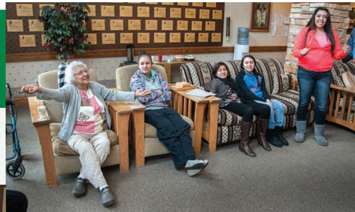
The elders pass along some sly and deceptive moves to the younger ones to carry on the traditional hand games.

games with the residents. Native Americans have been playing hand games for centuries. There are "hiding teams" and "guessing teams", with the object to trick the opponent through slight-of-hand into wrongly guessing which hand you've hidden short sticks. The games are played to native drumbeats and often result in laughter. They have become so popular that serious hand game tournaments are played at powwows and Indian gatherings throughout the country.