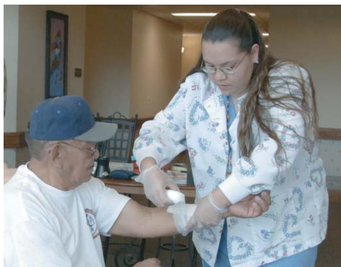
First aid training for Resident Attendants.