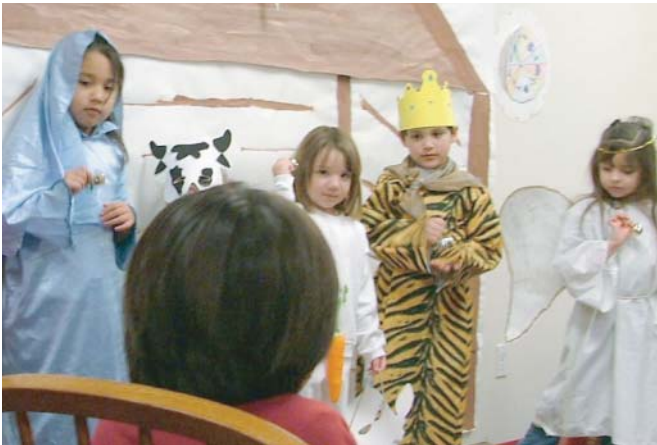
Montessori children's Christmas program