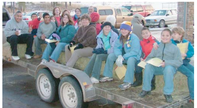
A church group leaving after singing carols