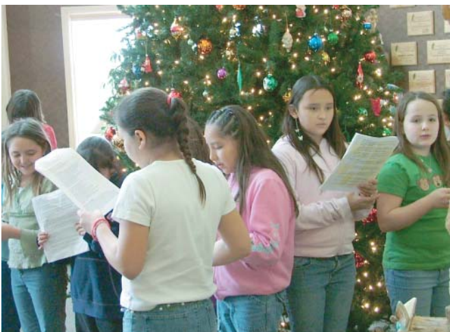
Singing Christmas carols for the elders