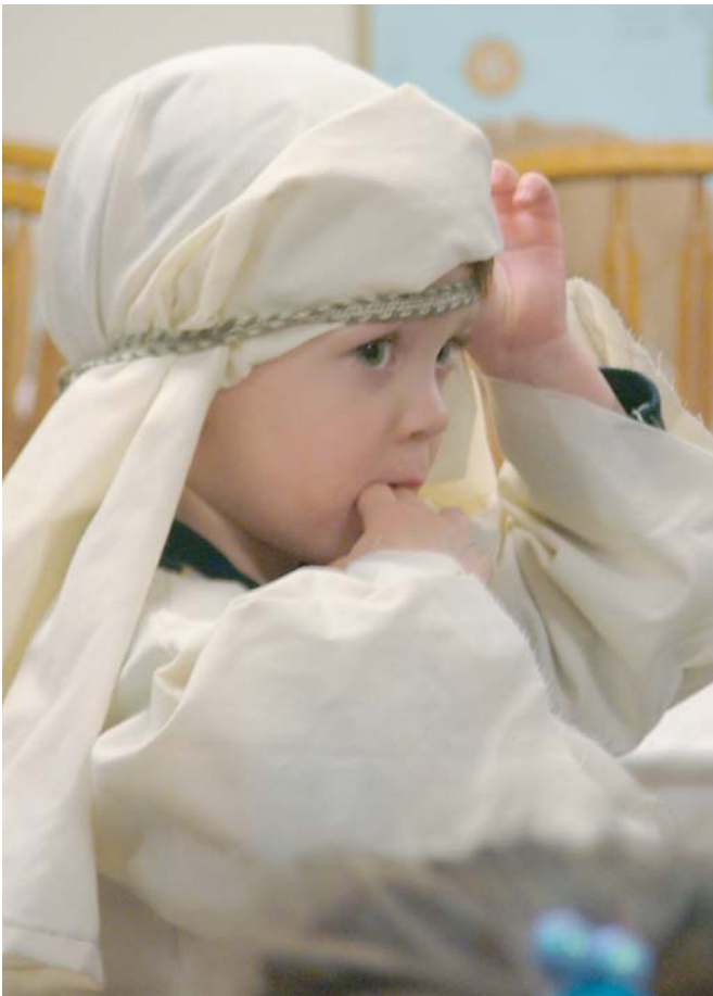
Montessori Christmas program St. Joseph

The greatest blessings for the elders and all of us at the Soaring Eagle Heritage Living Center are the generous donations from you, our friends. It is your generosity, gifts and encouragement that make this beautiful home, "the miracle on the hill," possible.