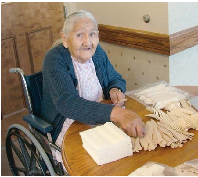
Getting ready for a party.