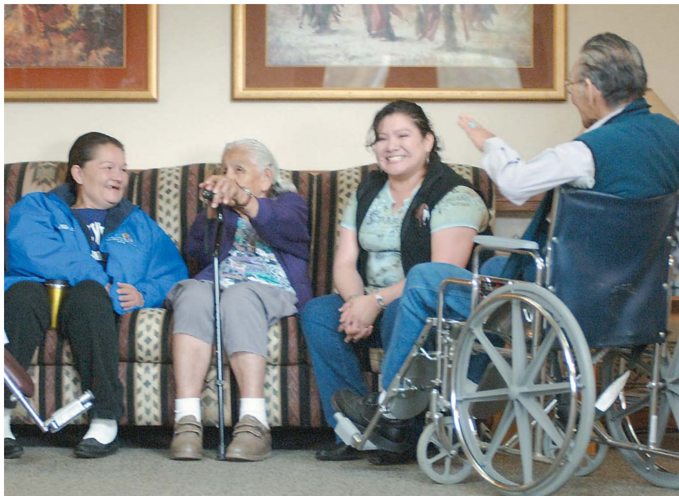
Story telling time.