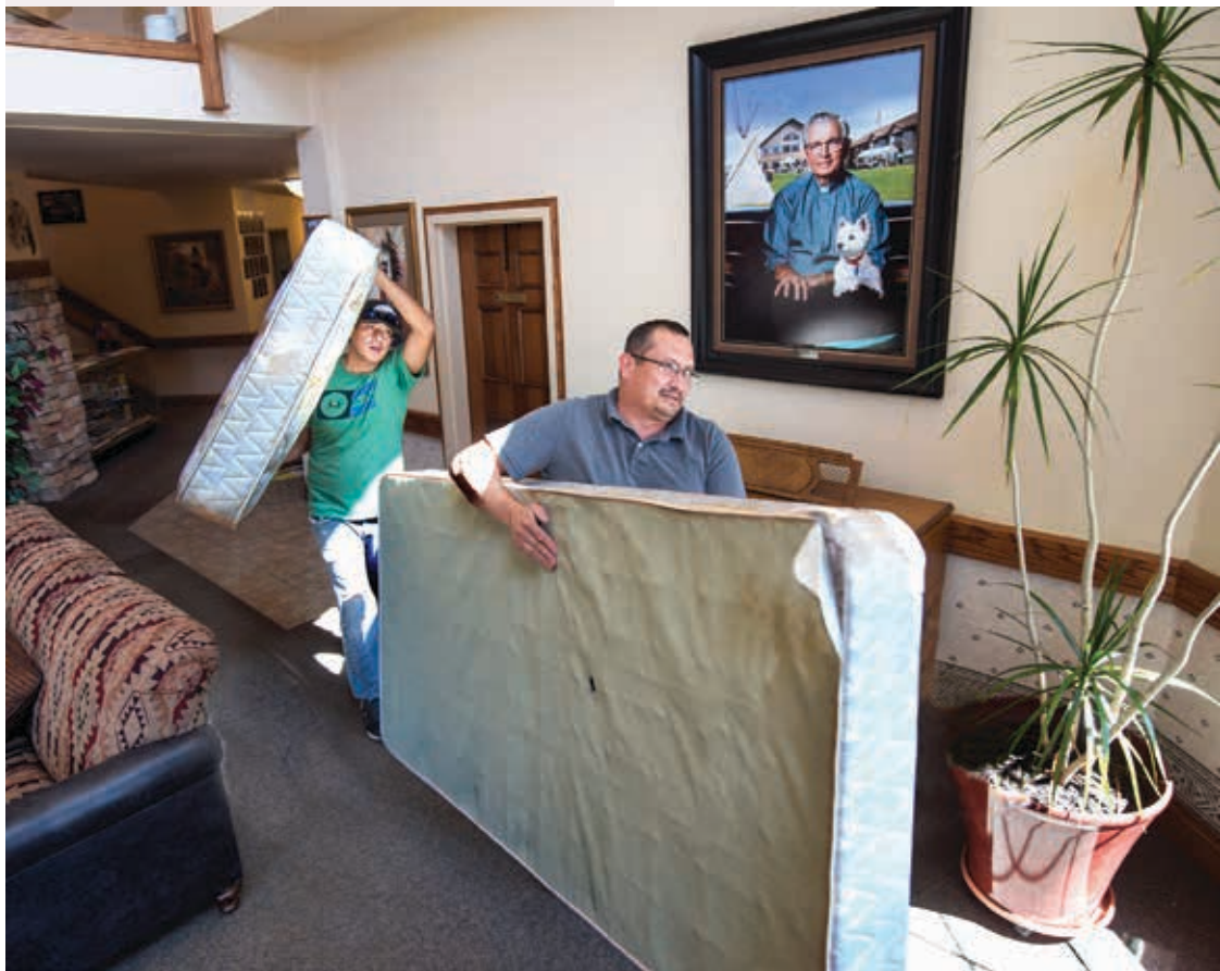
HLC staff removing a few of the aged, worn-out mattresses.