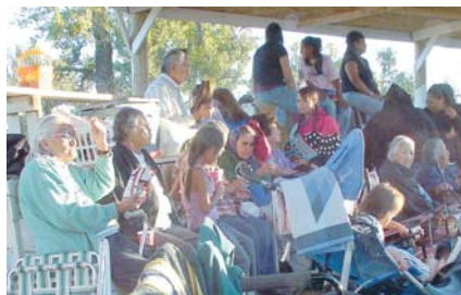
Elders enjoying the Powwow