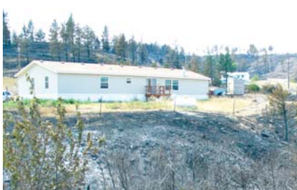
Aftermath of fire near Ashland