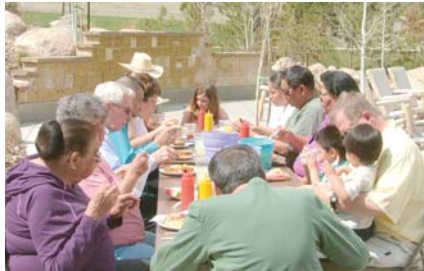
A Picnic in Eagle Ridge Park