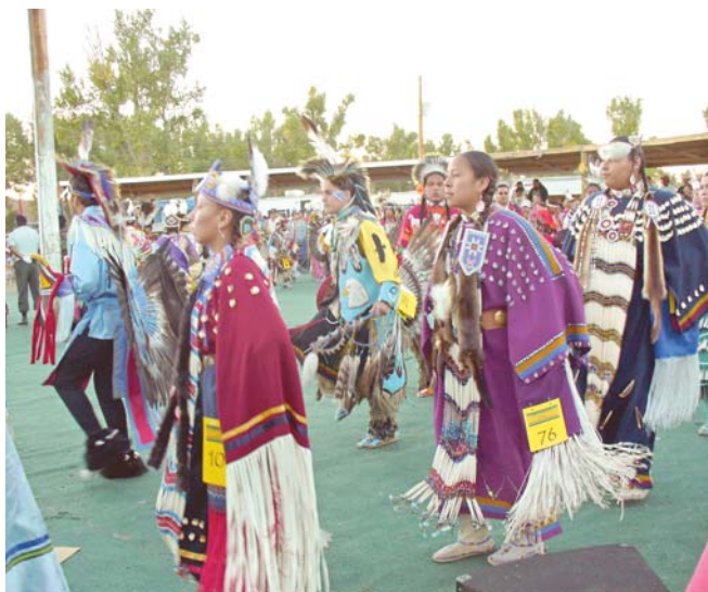
Dancers at the 4th of July Powwow