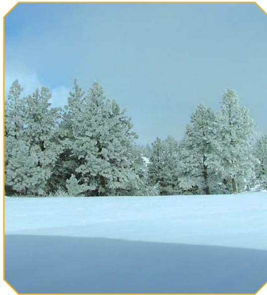
A Montana spring snow storm

But the snow gradually melted and green grass was the first sign that spring had finally arrived. I wish you could visit our Eagle Ridge Park as it comes alive with birds and animals. First, the robins arrived and then we heard the