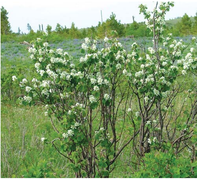
Juneberrries in bloom promise a good harvest

melodious songs of the meadowlarks and yellow finches playing near the ponds. The elders love the wildflowers and they are always intrigued with the wild park mothers, deer and antelope, showing off their little fawns. “Maheo” the Creator, has truly made Eagle Ridge Park a paradise for nature lovers.