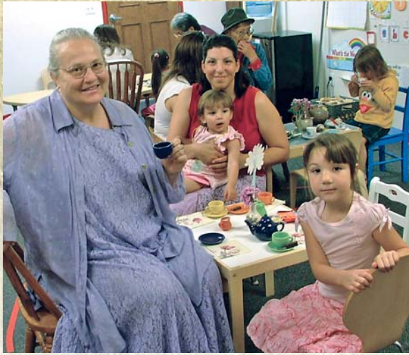
Montessori School's Mother's Day Tea Party

The Heritage Living Center Montessori School and Day Care Center children honored their mothers and all grandmothers at the Center with a special tea on the Friday before Mother's Day. The children carefully poured tea for their guests and served cookies before sitting down to visit with their guests.