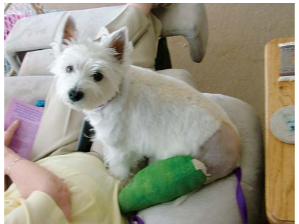
Fergie was in a cast for ten days

short walks, but she can't run, climb stairs or jump. For a lively little Westie this is the most difficult part of her recovery.