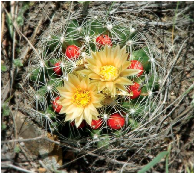
The persistent cactus