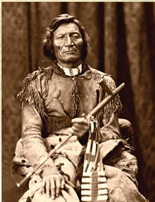
Chief Dull Knife

and inhumane conditions, they fled. Most of them were killed within minutes, but soldiers followed children who had hidden in a hole in the ground. They called to the little children to come out and they would be safe. When the children showed themselves, they were slaughtered.